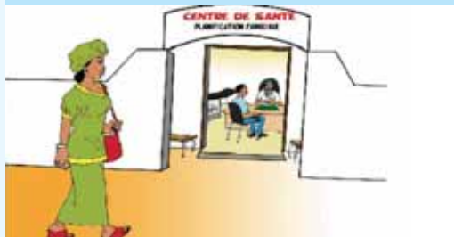
Wafde feere,tuugnaade e ndaɗɗudi potal hakkunde gorko e debbo, haa yimbe ndaŋa peeje yottanaade sarwisaaji safaara dii