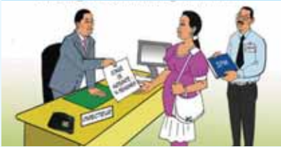
Kadgol riiwogol debbo e golle mum, tawa saabiidum ,ko cowagol makko, walla fooftere jibingol makko Kala baddo dum sariya yana e mum