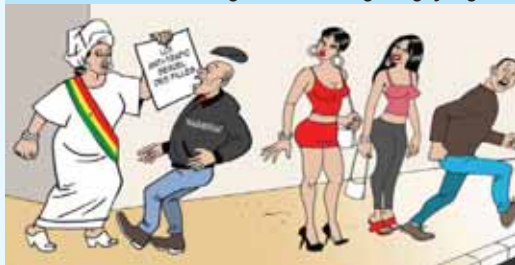
Moomta haa laaɓa, e nder geece mum dee fof, njeeygu rewɓe kam e kuutoragol ɓe to banngɗe cagayaagal

Dowlaaji-terde dii edi yetta kala lelnaade kaande, haa arti e lelnaade laawol, ngam ittude, e kala mbaadi, njeeygu rewɓe kam e kuutoragol cagayaagal rewɓe (jeeygol rewɓe ko'e mu'en).